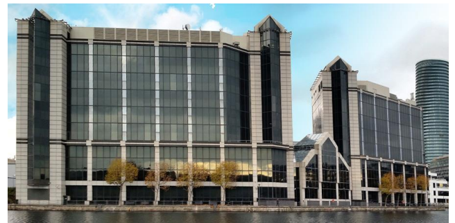
Telstra Security Centre (TSC) located at Telstra's London Hosting

TSS are backed by Telstra's global partnerships with industry-leading technology vendors including Microsoft, Palo Alto Networks, Cisco, and Netskope.